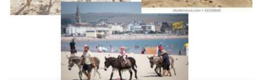
Seaside Holidays About 50 Years ago