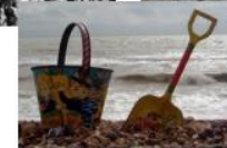
Seaside Holidays in Victorian Times