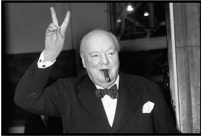
Winston Churchill- Prime Minister of Britain 1940-1945 (and 1951-1955)