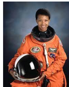
Mae Jemison became the first African-American woman to travel into space in 1992.

If something is absorbent, what does it soak up?