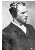
Chester Greenwood invented earmuffs in 1873, aged 15.