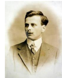
George Mottershead founded Chester Zoo in 1931.