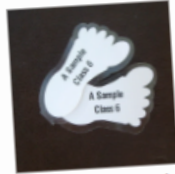
Peel & Stick Shoe Labels

5 Name Labels £ 1.00 10 Name Labels £ 1.75 £1.50 15 Name Labels £ 2.50