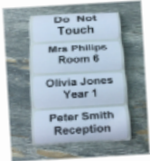
Peel & Stick Labels

10 Labels £ 2.00 20 Labels £ 3.50 30 Labels £ 5.00